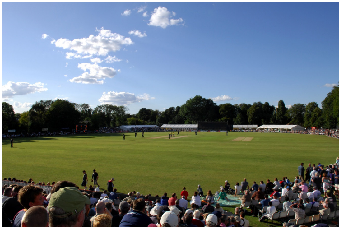
Woodbridge Road during the Cricket Festival in July